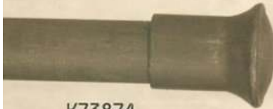
K73874 Finial: End Cap Pair 2.25" L x 2" H x 2" W Finishes: 01, 02, 03, 04 Shown in 04-Gunmetal