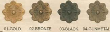
01-GOLD 02-BRONZE 03-BLACK 04-GUNMETAL