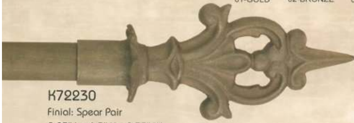
K72230 Finial: Spear Pair 9.25" L x 4.5" H x 2.75" W Finishes: 01, 02, 03, 04 Shown in 04-Gunmetal