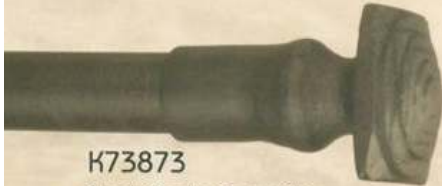
K73873 Finial: Ormate Square Pair 4" L x 2.75" H x 2.75" W Finishes: 01, 02, 03, 04 Shown in 03-Black