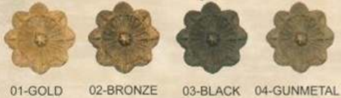
01-GOLD 02-BRONZE 03-BLACK 04-GUNMETAL