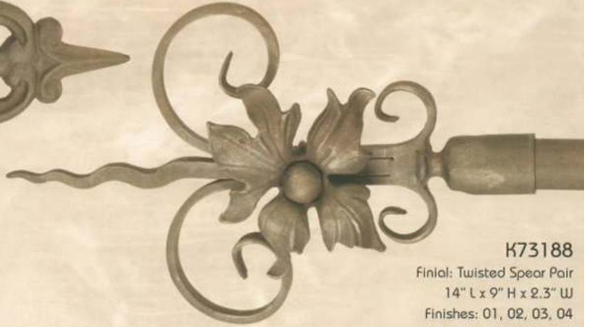
K73188 Finial: Twisted Spear Pair 14" L x 9" H x 2.3" W Finishes: 01, 02, 03, 04 Shown in 04-Gunmetal