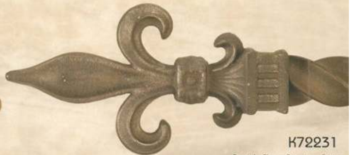
K72231 Finial: Fleur Design Pair 9" L x 5" H x 2" W Finishes: 01, 02, 03, 04 Shown in 04-Gunmetal

FOR USE WITH ROUND & TWISTED METAL POLES