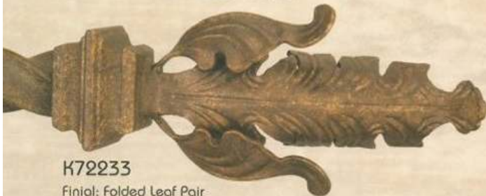
K72233 Finial: Folded Leaf Pair 10" L x 5.5" H x 4" W Finishes: 01, 02, 03, 04 Shown in 02-Bronze

FOR USE WITH ROUND & TWISTED METAL POLES