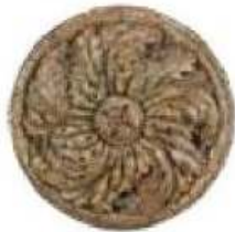
25 - TUSCAN (SHOWN)