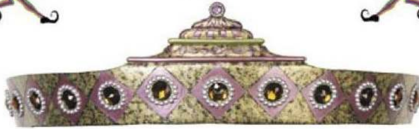
P6708 Corona: Cirque De Paris 22.5" W x 12" D x 6" H finishes: As Shown