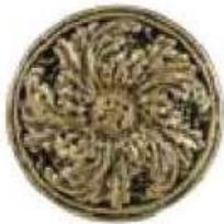
18 - PALATIAL GOLD