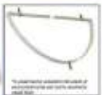
The crown is placed on the head of the coronation gown as shown in the diagram.

P5883-12 Corona: The Barchano 27" H x 27" W x 17" D Made in Italy Corona: The Barchano in Applique & Embroidered Fabric