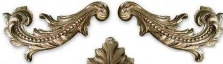
3037-81 SCROLL PAIR 4.25H 9W 7D 4RTN CASE:4