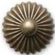
3729-81 SQ. FLUTED OVAL 2DIA 2.75D CASE:6