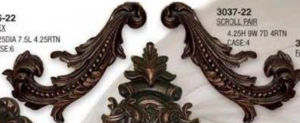
3037-22 SCROLL PAIR 4.25H 9W 7D 4RTN CASE:4