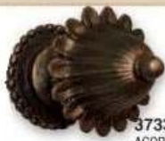
3733-22 ACORN 2DIA 3.25D CASE:6