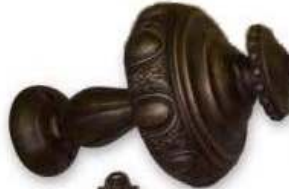
3046-22 SUSSEX 4.25DIA 7.5L 4.25RTN CASE:6