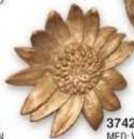
3742-12 MED. VAN GOGH PAIR 3.25H 4.5W CASE:6