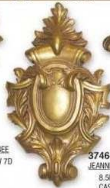
3746-30 JEANNE MARIE 8.5H 3.75W 5D 3.5RTN CASE:6