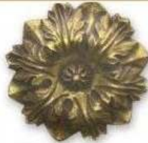
3044-34 TIEBACK: ACANTHUS 4.25DIA 4.5D 3.75RTN CASE:6