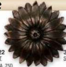
3047-22 SUNFLOWER 4.25DIA .75D CASE:6