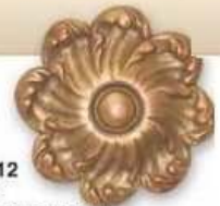
3747-12 NATALIE 5H 4.75W 5D 3.6RTN CASE:6