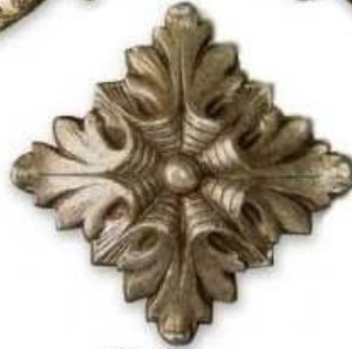
2039-81 SQUARE TIEBACK 6.25H 6.25W 3.75RTN CASE:6