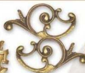
8996-30 TIEBACK LAFAYETTE PAIR 2.5 RTN CASE:6