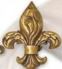
3058-30 SM FLEUR DE LIS 6.5H 5W 5.75D 3.5RTN CASE:6