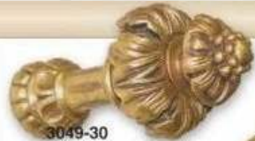
3049-30 FANCY 3.25H 7.25D 4.5RTN CASE:6