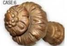
3049-12 TIEBACK: FANCY 3.25H 7.25D 4.5RTN CASE:6