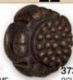
3731-22 OGLETHORPE 2DIA 1.5D CASE:6