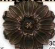
3051-22 STEWART 3.5DIA .75D CASE:6