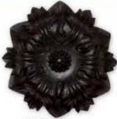
3044-31 ACANTHUS 4.25DIA 4.5D 3.75RTN CASE:6