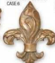
3058-12 SM. FLEUR DE LIS 6.5H 5W 5.75D 3.5RTN CASE:6