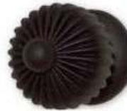
3729-31 SQ. FLUTED OVAL 2DIA 2.75D CASE:6