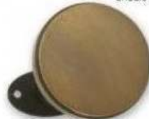
8778-40-76 END CAP PAIR 2DIA 4D 3.75RTN CASE:6