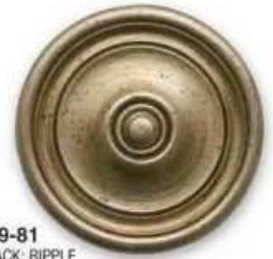
3909-81 TIEBACK: RIPPLE 3.75DIA 4.75D 4RTN CASE:6