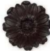
3051-31 STEWART 3.5DIA .75D CASE:6