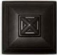
8777-40-40 SQ ARCHITECTURAL PAIR 2.5SQ 5.75D 3.75RTN CASE:6 PR