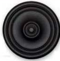
3909-31 TIEBACK: RIPPLE 3.75DIA 4.75D 4RTN CASE:6