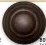
8938-22 TIERED DOME 3.125DIA 2.5RTN CASE:6