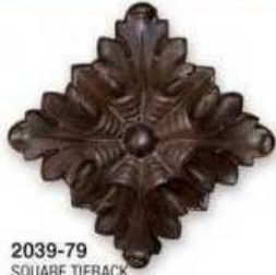
2039-79 SQUARE TIEBACK 6.25H 6.25W 3.75RTN CASE:6