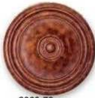
3909-70 TIEBACK: RIPPLE 3.75DIA 4.75D 4RTN CASE:6