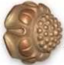
3731-12 MED. OGLETHORPE 2DIA 1.5D CASE:6