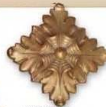
2039-12 SQUARE TIEBACK 6.25H 6.25W 3.75RTN CASE:6