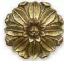
3051-34 STEWART 3.5DIA .75D CASE:6