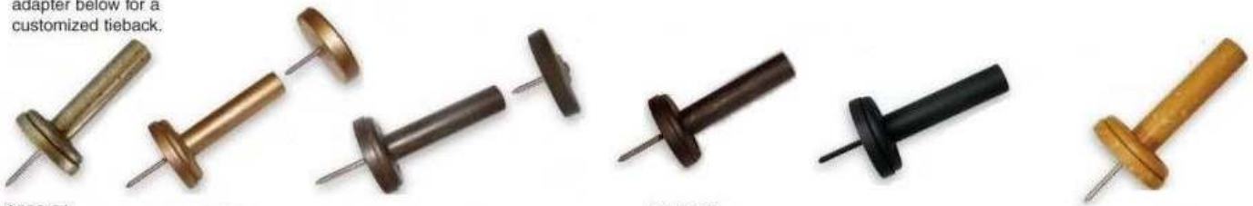
9302-81 FINIAL ADAPTER 3.875 RTN CASE:12

Choose any finial to screw into the adapter below for a customized tieback.