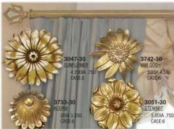
3047-30 SUNFLOWER 4.25DIA .75D CASE:6