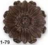
3051-79 MEDALLION: STEWART 3.5DIA .75D CASE:6