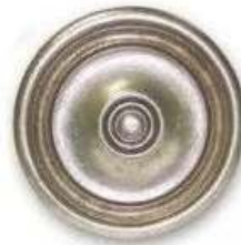
3909-05 TIEBACK: RIPPLE 3.625DIA 4.75D 4RTN CASE:6