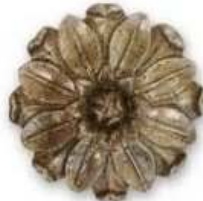
3051-81 STEWART 3.5DIA .75D CASE:6