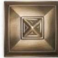
8777-40-76 SQ ARCHITECTURAL PAIR 2.5SQ 5.75D 3.75RTN CASE:6 PR