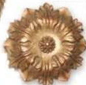
3044-12 TRK: ACANTHUS 4.25DIA 3.75RTN CASE:6