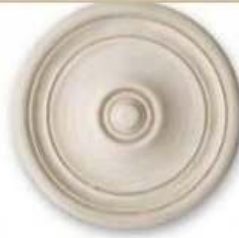
3909-80 TIEBACK: RIPPLE 3.75DIA 4.75D 4RTN CASE:6