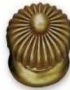
3729-34 SQ. FLUTED OVAL 2DIA 2.75D CASE:6