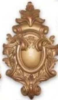
3746-12 JEANNE MARIE 8.5H 3.75W 5D 3.5RTN CASE:6