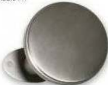
8778-75-75 END CAP PAIR 2DIA 4D 3.75RTN CASE:6