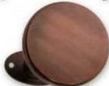
8778-74-74 END CAP PAIR 2DIA 4D 3.75RTN CASE:6