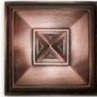
8777-74-74 SQ ARCHITECTURAL PAIR 2.5SQ 5.75D 3.75RTN CASE:6 PR