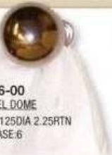
8946-00 NICKEL DOME 2.125DIA 2.25RTN CASE:6

Choose any finial from the Artifactory line to customize your own tiebacks.