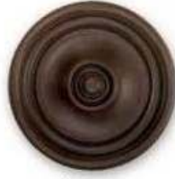
3909-79 TIEBACK: RIPPLE 3.75DIA 4.75D 4RTN CASE:6