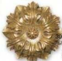
3044-30 ACANTHUS 4.25DIA 4.5D 3.75RTN CASE:6