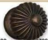
3729-22 SQ. FLUTED OVAL 2DIA 2.75D CASE:6