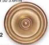
3909-12 RIPPLE 3.75DIA 4.75D 4RTN CASE:6