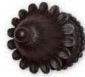
3733-31 ACORN 2DIA 3.25D CASE:6