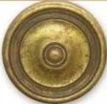
3909-34 TIEBACK: RIPPLE 3.75DIA 4.75D 4RTN CASE:6