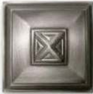
8777-75-75 SQ ARCHITECTURAL PAIR 2.5SQ 5.75D 3.75RTN CASE:6 PR