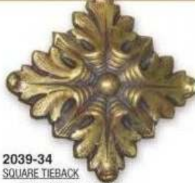
2039-34 SQUARE TIEBACK 6.25H 6.25W 3.75RTN CASE:6