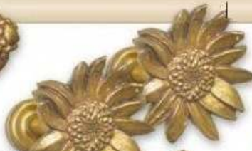
3038-30 VAN GOGH SUNFLOWER PAIR 4.25H 5.75W 5D 4RTN CASE:6