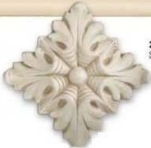
2039-80 SQUARE TIEBACK 6.25H 6.25W 3.75RTN CASE:6