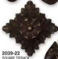
2039-22 SQUARE TIEBACK 6.25H 6.25W 3.75RTN CASE:6