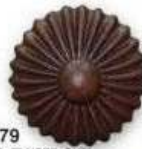
3729-79 MED: SQ. FLUTED OVAL 2DIA 2.75D CASE:6