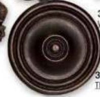
3909-22 TIEBACK RIPPLE 3.75DIA 4.75D 4RTN CASE:6