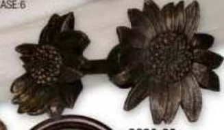
3038-22 VAN GOGH PAIR 4.25H 5.75W 5D 4RTN CASE:6