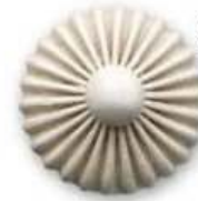
3729-80 SQ. FLUTED OVAL 2DIA 2.75D CASE:6