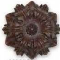
3044-79 TIEBACK: ACANTHUS 4.25DIA 4.5D 3.75RTN CASE:6