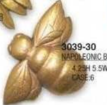
3039-30 NAPOLEONIC BEE 4.25H 5.5W 7D CASE:6