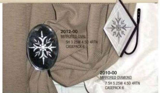
2012-00 MIRRORED OVAL 5H 3.25W 4.5D 4RTN CASEPACK:6